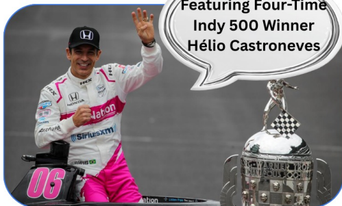
Featuring Four-Time Indy 500 Winner Hélio Castroneves

Sponsor general admission breakfast tickets (3) for organizations that do not have the budget to attend.