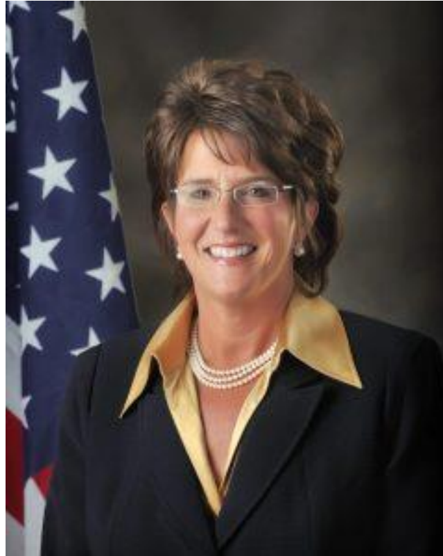
Congresswoman Jackie Walorski 2 nd District of Indiana