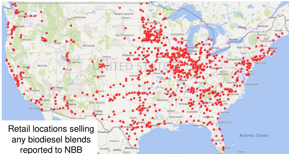
Retail locations selling any biodiesel blends reported to NBB

http://biodiesel.org/using-biodiesel/finding-biodiesel/retail-locations/retail-map