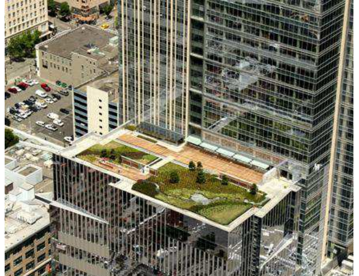
Washington Mutual Center Green Roof